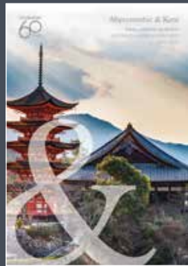
SMALL GROUP JOURNEYS