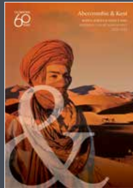
NORTH AFRICA & MIDDLE EAST