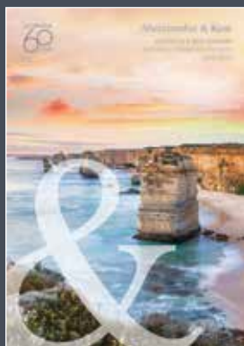
AUSTRALIA & NEW ZEALAND