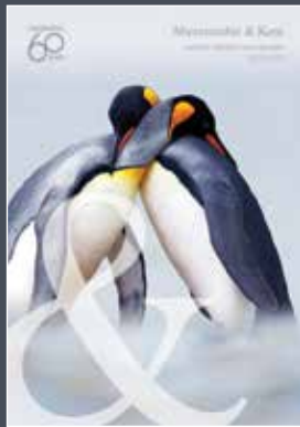
LUXURY EXPEDITION CRUISES